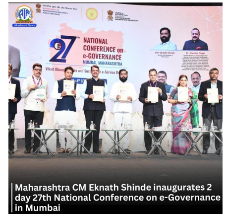
Maharashtra CM Eknath Shinde inaugurates 2 day 27th National Conference on e-Governance in Mumbai