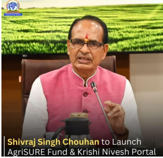
Shivraj Singh Chouhan to Launch AgriSURE Fund & Krishi Nivesh Portal