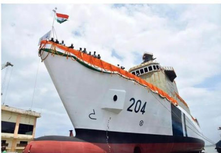
The Indian Coast Guard's pollution control vessel Samudra Pratap launched at Goa Shipyard on Thursday