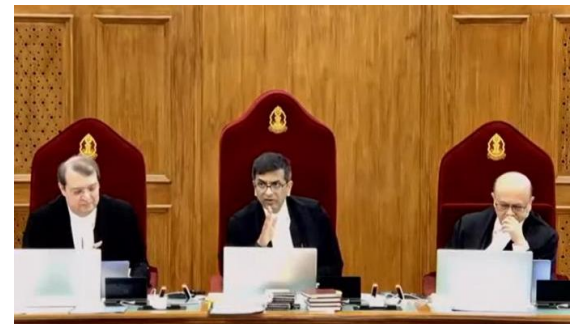
Supreme Court to Set Up National Task Force to Work Out Modalities For Safety At Workplace For Doctors