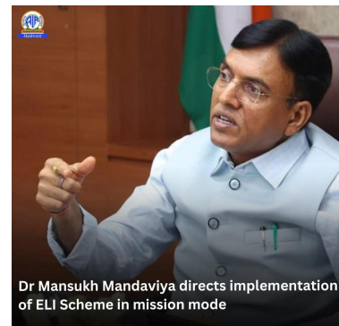
Dr Mansukh Mandaviya directs implementation of ELI Scheme in mission mode